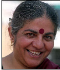
VANDANA SHIVA, environmental activist

In his lecture at the World Conference on Religions in Chicago, Tagore said that India differs from the West because our learning has come from the forest; whereas, in the West, it came from universities built of brick and mortar. Just as in a forest every species has a place, Indian society is based on diversity and pluralism. A forest is living. Our civilisation too centres on the maintenance and enrichment of life on earth and in society, not on accumulation of material goods and exploitation of the earth.